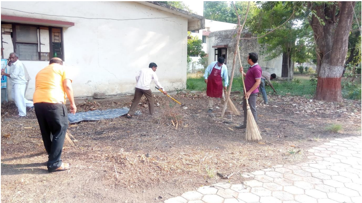
Office Exhibition Ground cleaning work activity by officials & staff ,MSME-DI, Indore.