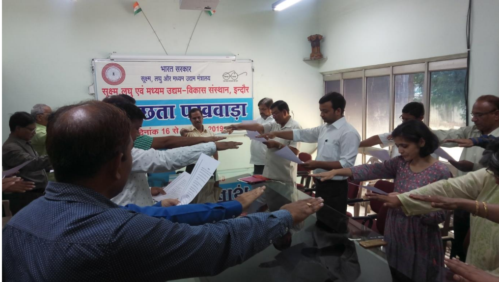
Pledge on Swachhata Pakhwada taken by officer and staff, MSME-DI, Indore