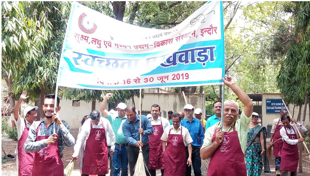
Awareness on Swachhata Pakhwada by all officials & staff, MSME-DI, Indore.