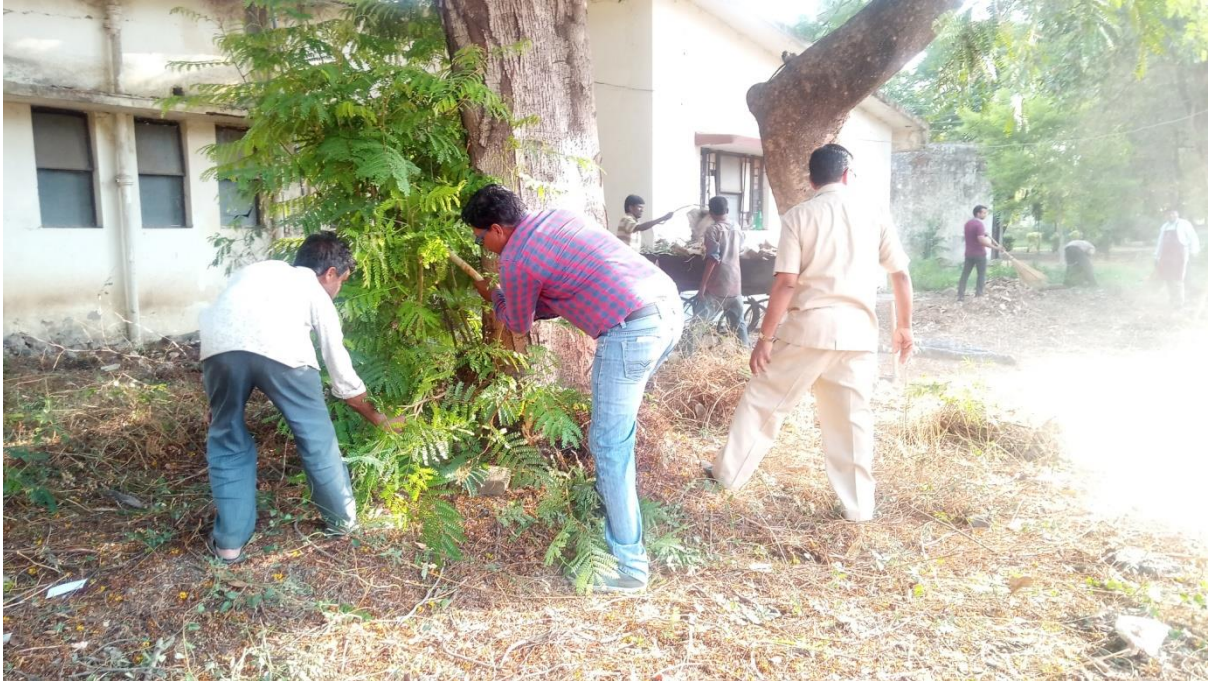
Office Exhibition Ground cleaning work activity by officials & staff, MSME-DI, Indore.