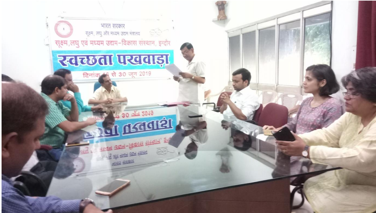
Discussion on Swachhata Pakhawada ( 16-30) June 2019 planning at MSME DI, Indore