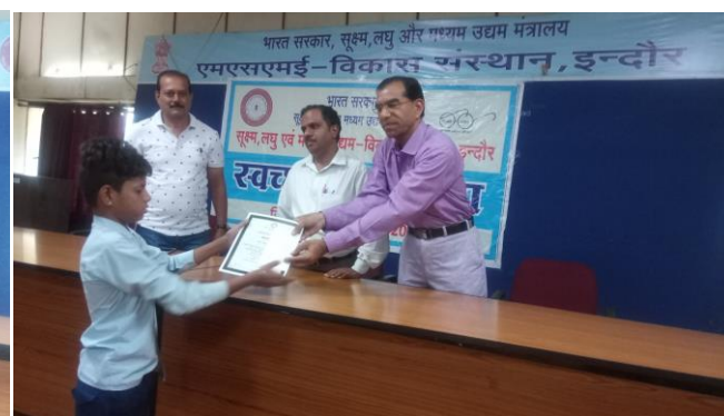
Prize distribution on painting competition