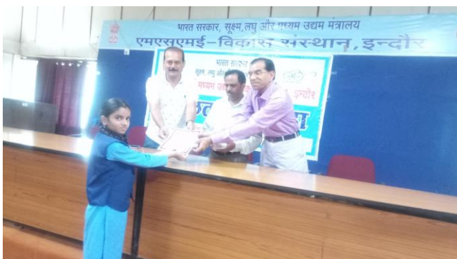
Prize distribution on essay competition